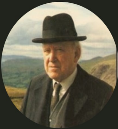
DR. MARTYN LLOYD-JONES

FAITH IS A REFUSAL TO PANIC , COME WHAT MAY."